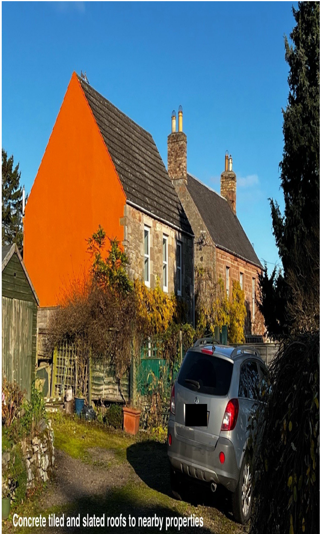
Concrete tiled and slated roofs to nearby properties