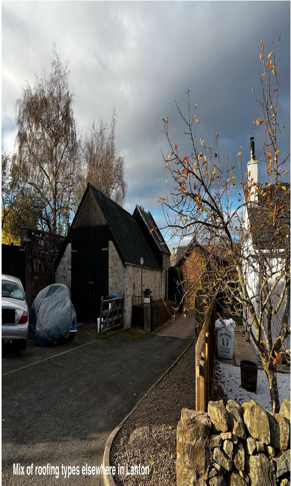
Mix of roofing types elsewhere in Lanton