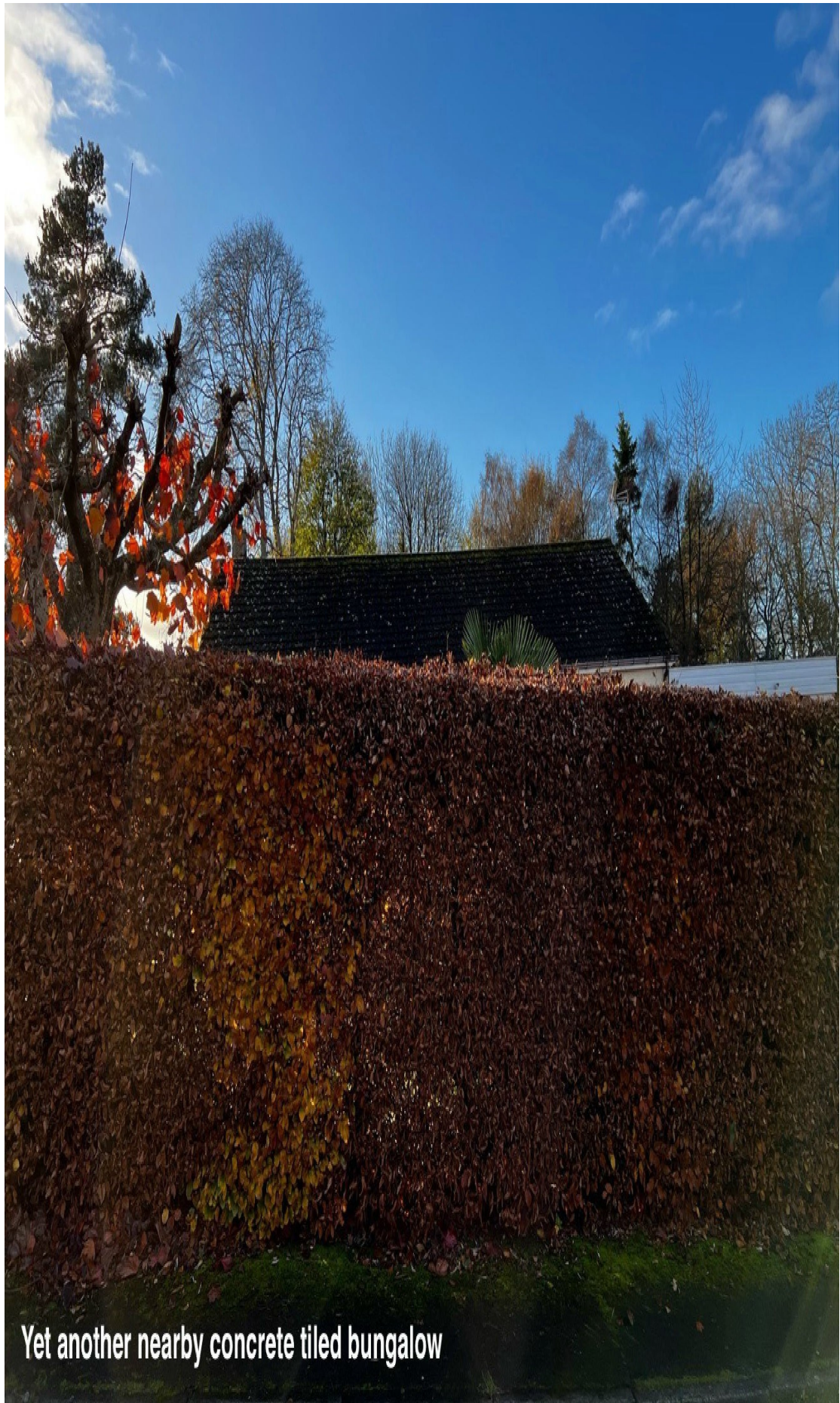
Yet another nearby concrete tiled bungalow