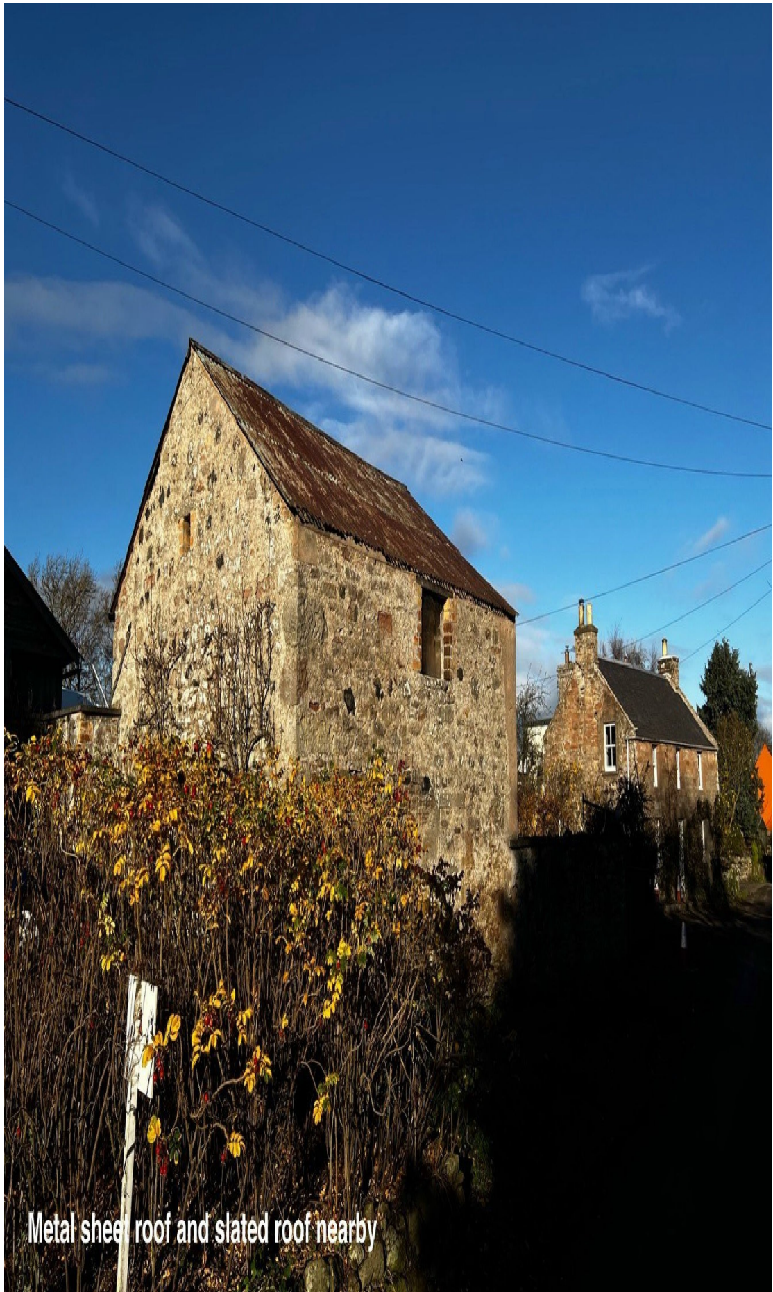
Metal sheet roof and slated roof nearby