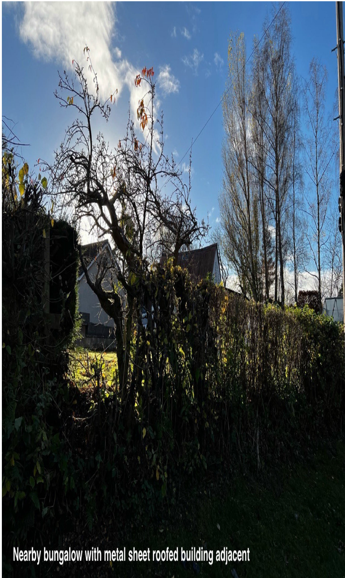
Nearby bungalow with metal sheet roofed building adjacent