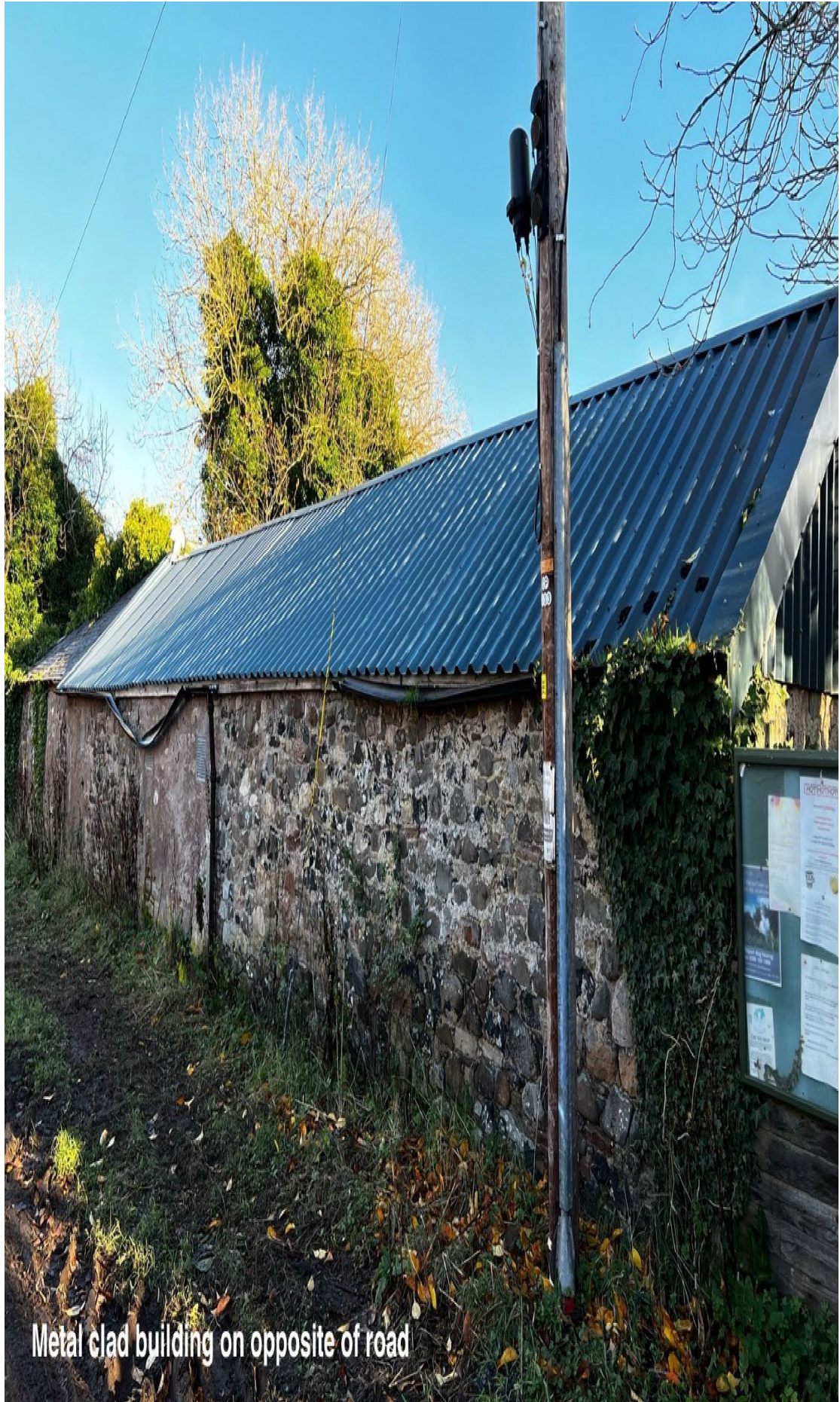
Metal clad building on opposite of road