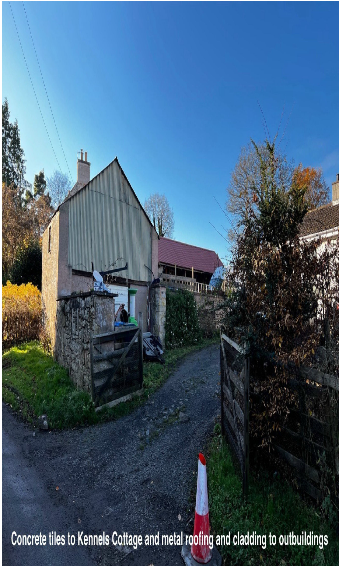
Concrete tiles to Kennels Cottage and metal roofing and cladding to outbuildings