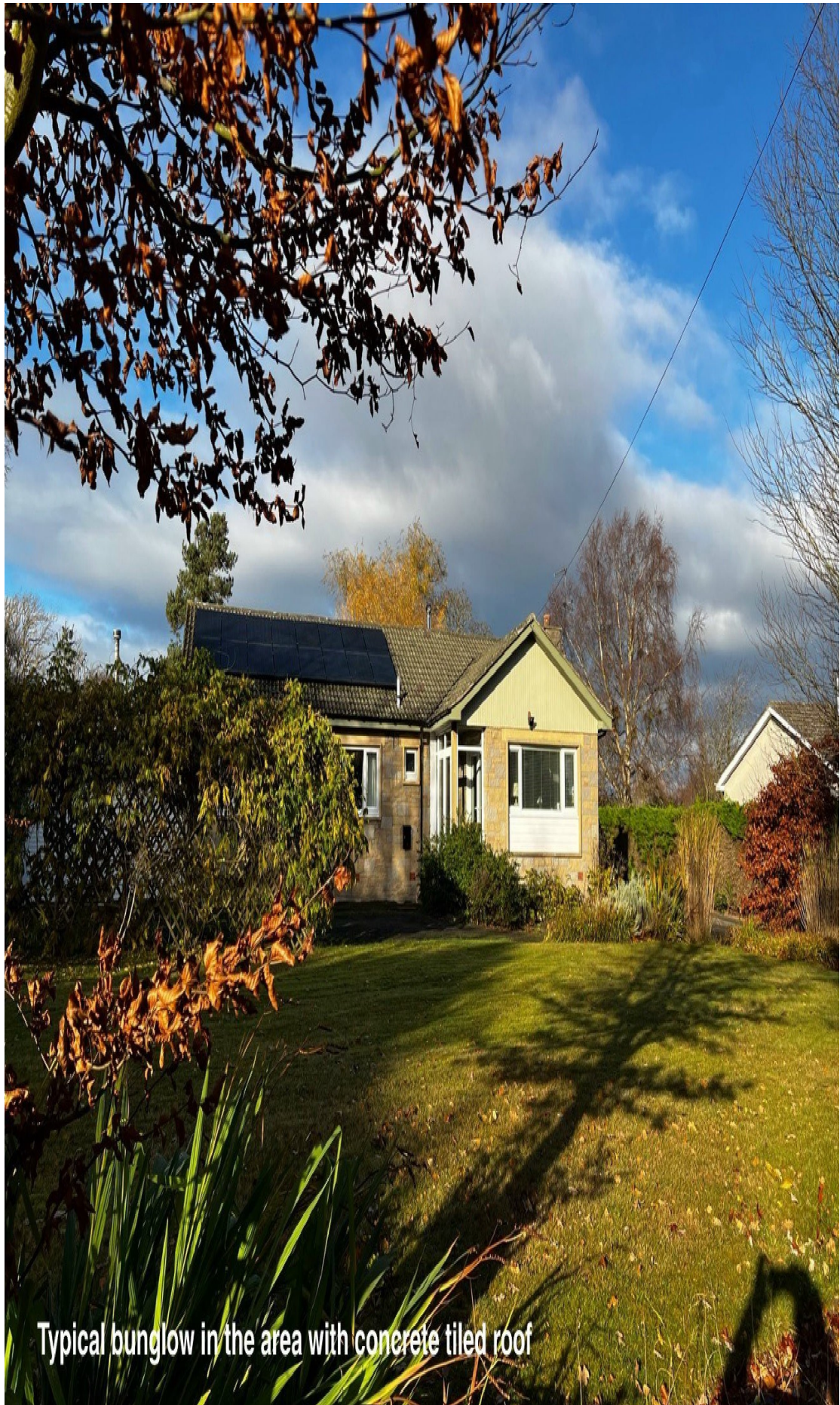
Typical bungalow in the area with concrete tiled roof