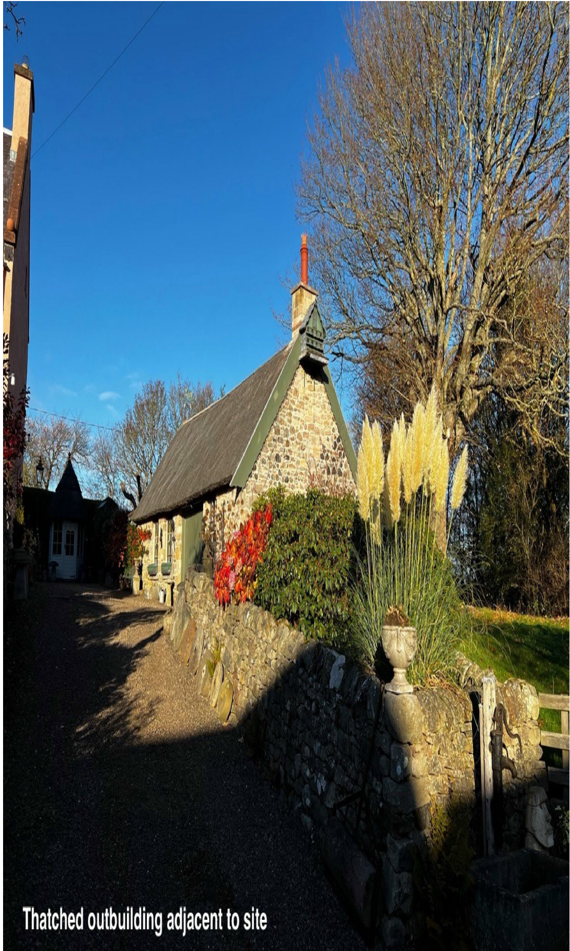
Thatched outbuilding adjacent to site