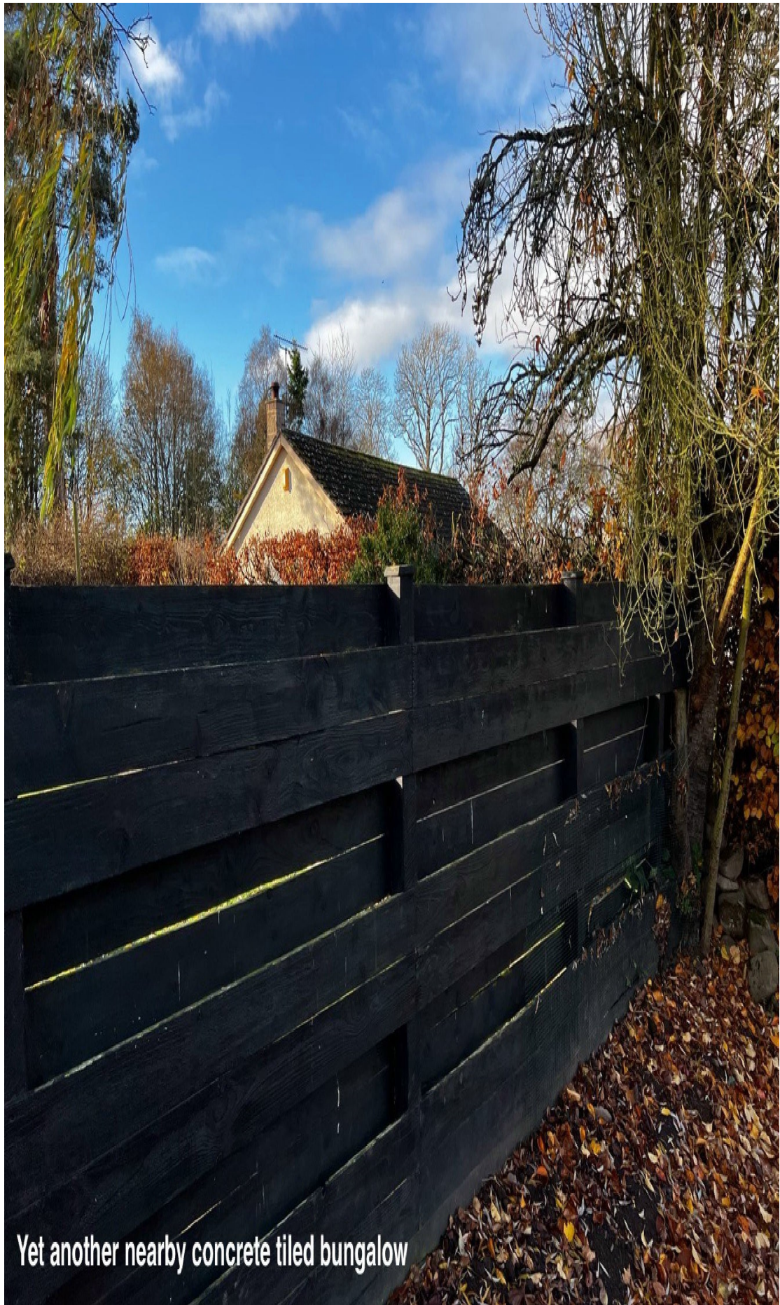
Yet another nearby concrete tiled bungalow