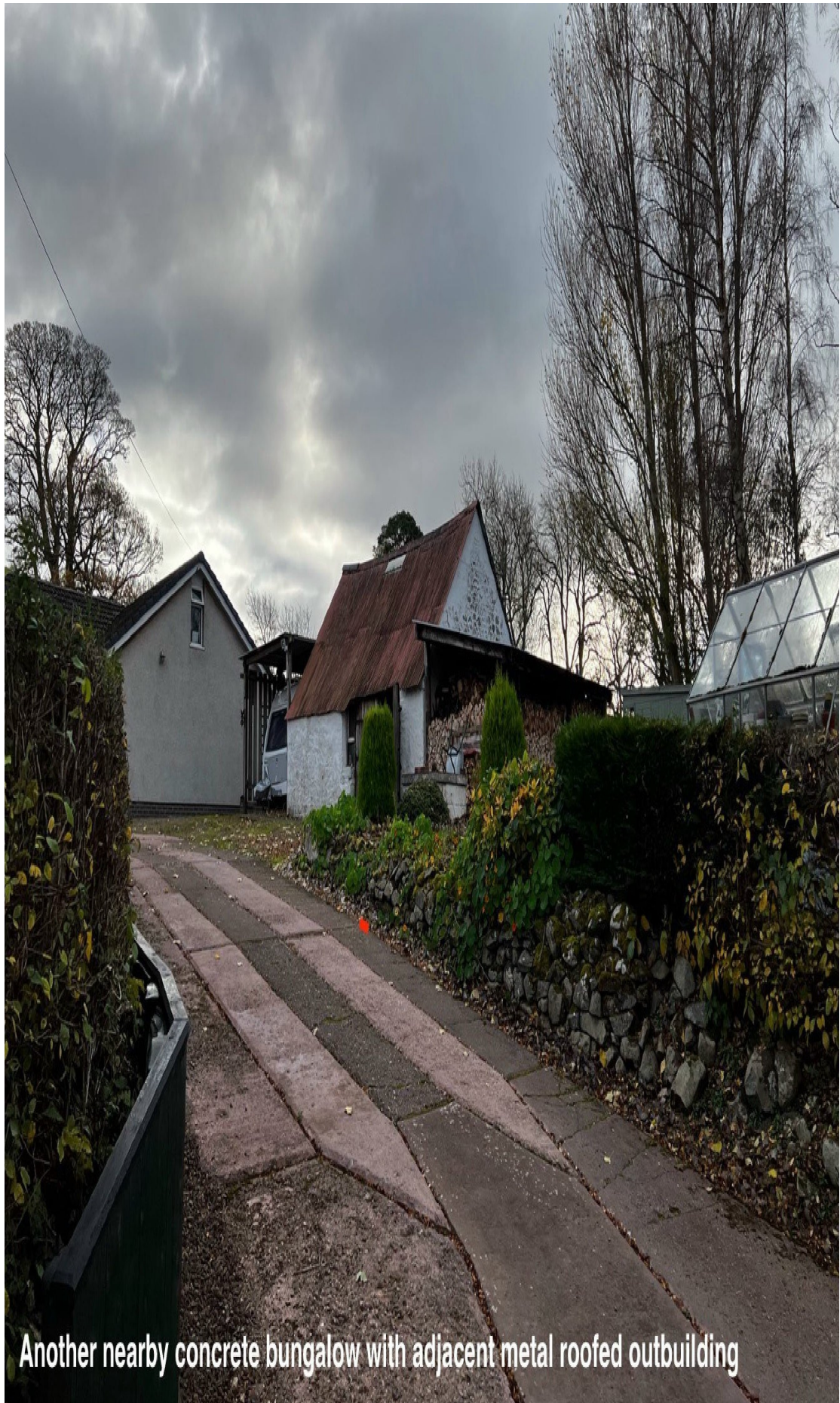
Another nearby concrete bungalow with adjacent metal roofed outbuilding