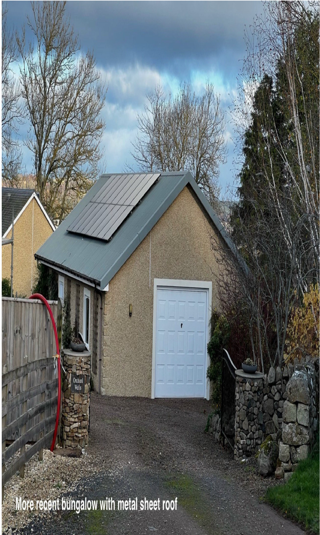
More recent bungalow with metal sheet roof